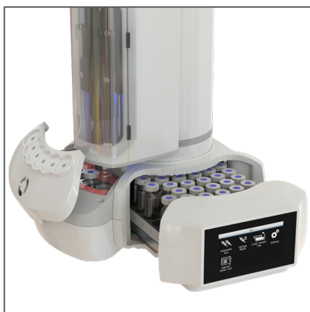
Vial unloading after conditioning